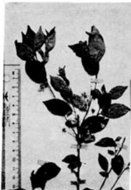
Photo. 1 Prunus japonica Thunb.