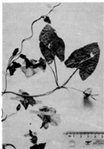
Photo. 9 Thunbergia alata Bojer ex Sims

Note: Thunbergia alata Bojer ex Sims is characterized by the central dark corolla, wing-like petioles and broad stigma.